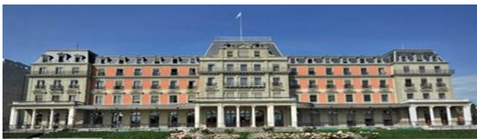
Office of the High Commissioner for Human Rights (OHCHR), Geneva, Switzerland